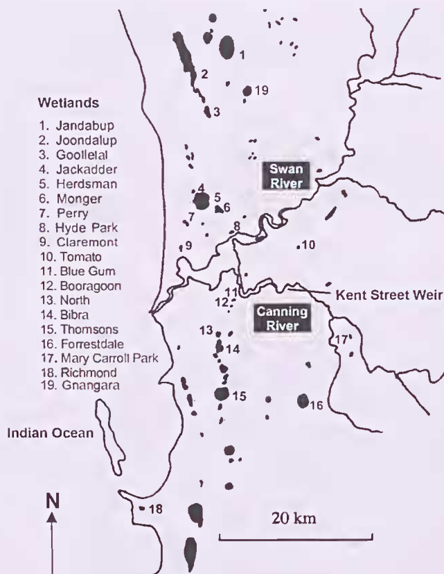
Figure 1. Map of the Swan Coastal Plain (Western Australia) showing the main wetlands and the Swan-Canning River estuary. The wetlands with Microcystis blooms recorded are indicated.

taxonomy and distribution, based on mostly unpublished data collected over the past 20 years.